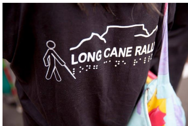
A Long Cane Rally Tshirt from a previous event